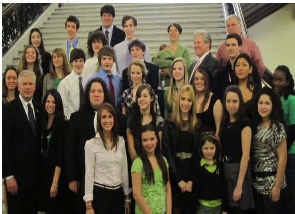
Green Schools Student Ambassadors and Green Rockers were Honored at the MA State House for their Outstanding efforts.

For more information about who we are, or how you can help, please visit our web site at www.projectgreenschools.org